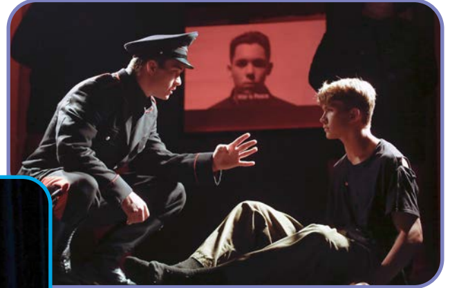
AACT YouthFest 2019 Workshop Theatre Willis, Texas 1984