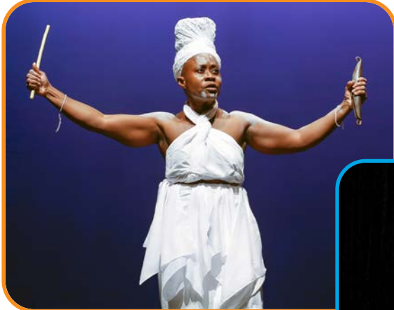
Coalescence Theatre Project Bloomington, Illinois Walking With My Ancestors

AACTFest 2021 will be held June 14 - 19, in Louisville, Kentucky