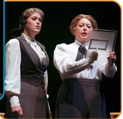
Salina Community Theatre Salina, Kansas Silent Sky