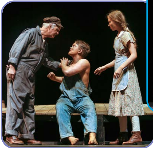
Wetumpka Depot Players Wetumpka, Alabama The Diviners