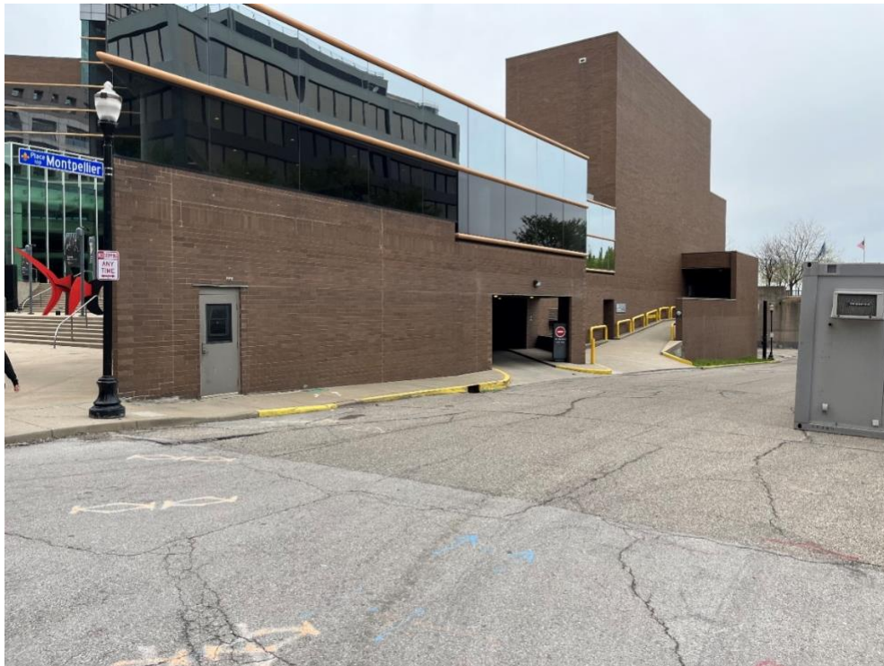
Loading dock ramp by yellow railings on Place Montpellier